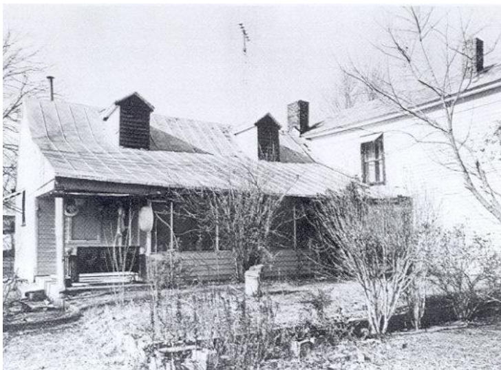
Boyd's Tavern, only remainder of original South Boston.

----- Boyd's Ferry was one of the earliest Dan river crossings established in Halifax County. The ferry crossed about where the Norfolk-Southern Railway bridge crosses the river today. The ferry's importance lay in part in the fact that over it passed the road from the south to Charlotte and Prince Edward Counties, Petersburg and Richmond.