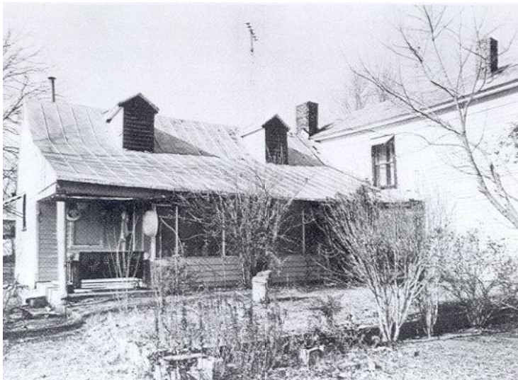
Boyd's Tavern, only remainder of original South Boston.

Boyd's Ferry was one of the earliest river crossings established in Halifax County. The ferry crossed about where the Norfolk-Southern Railway bridge crosses the river today. The ferry's importance lay in part in the fact that over it passed the road from the south to Charlotte and Prince Edward Counties, Petersburg and Richmond.